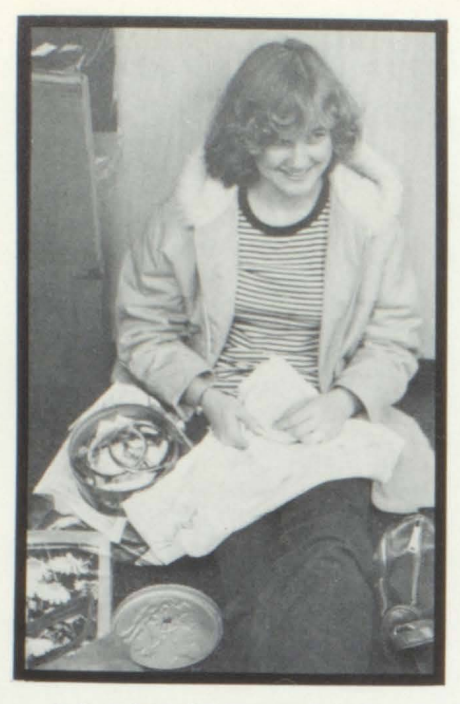
A fine friend you are to me!