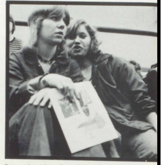
Quarrel with a friend-and you both are wrong.