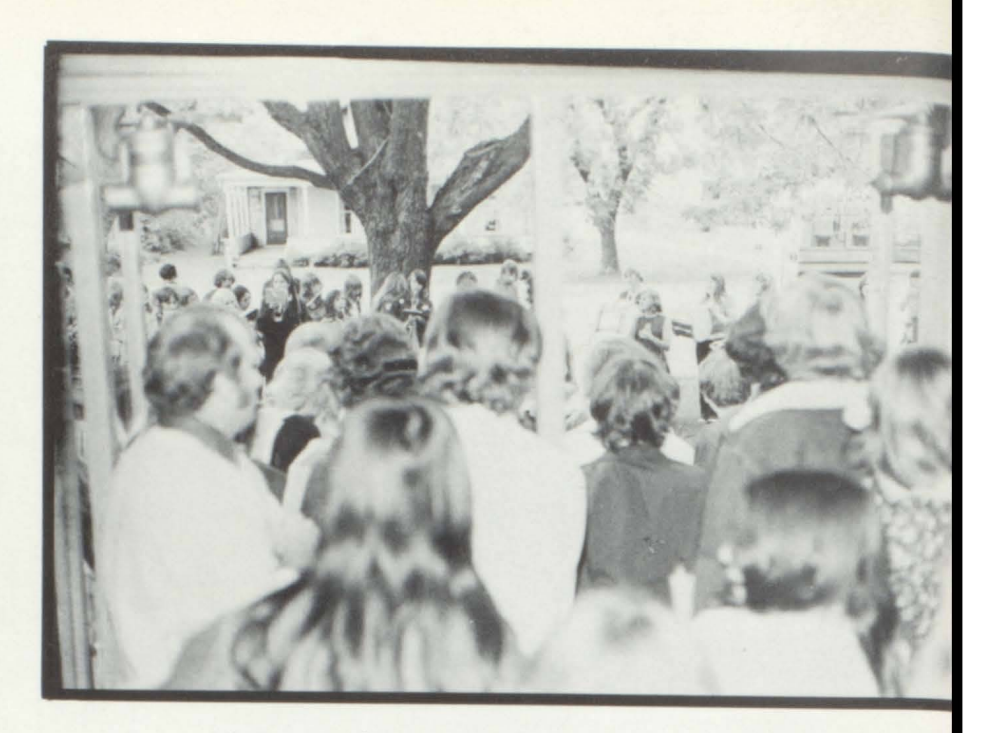
I have room for one more Friend and he is everyman.